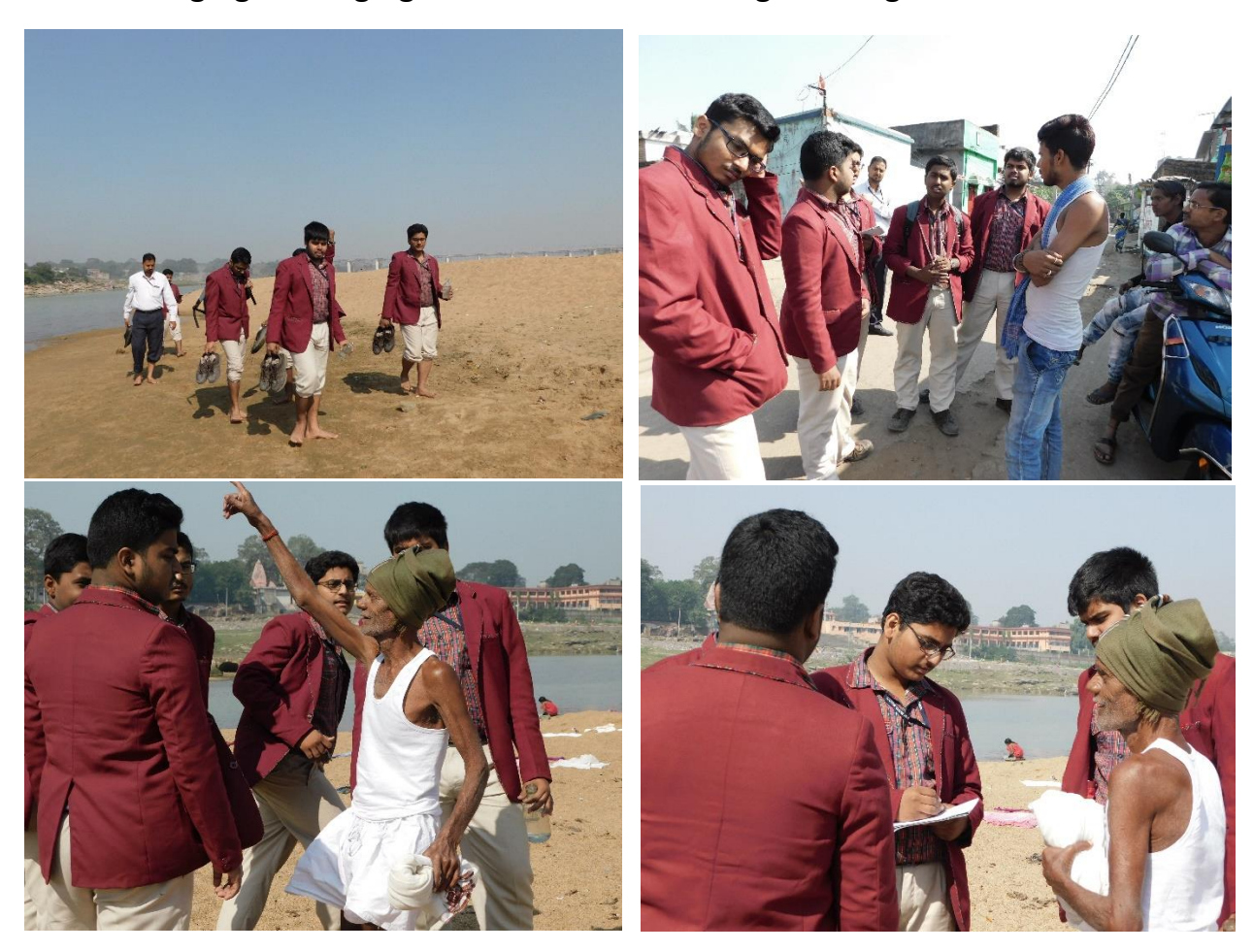
(1: deposition of alluvium n the river bed, 2: survey of local people, 3: survey of local people, 4: survey of local people)