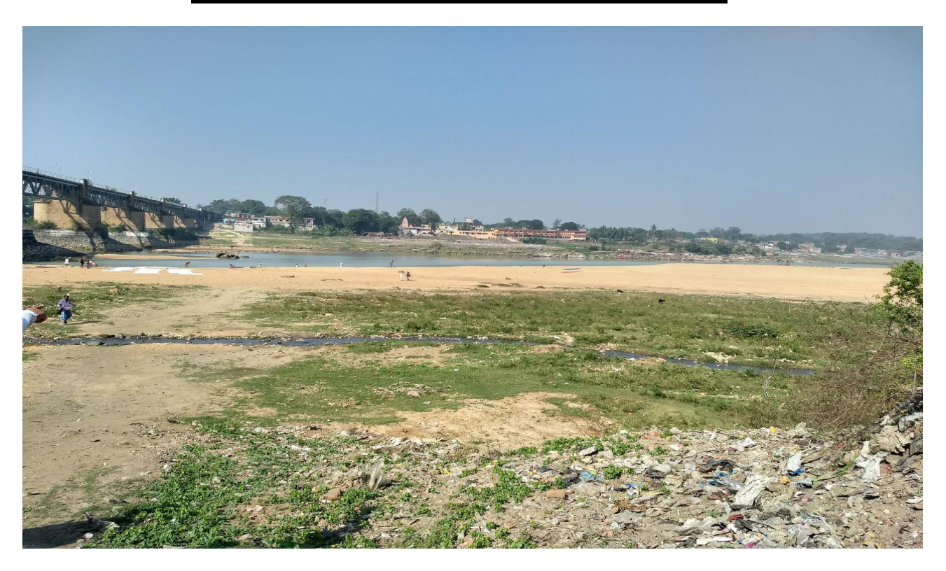
We were allotted BARAKAR river at Asansol to be our area of survey. We went there on 22/11/2017 from the school, along with our teacher.